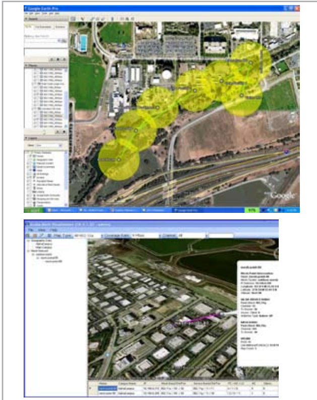
Detailed mesh visualization provides floorplans and maps with network topology overlay

The Aruba Secure Enterprise Mesh can support all enterprise wireless needs including Wi-Fi access, concurrent Wireless Intrusion Protection, wireless backhaul, LAN bridging, and point-to-multipoint connectivity, all with a single common infrastructure. Aruba's Quality of Service capabilities provide effective converged support for data, voice and video. Aruba's Secure Enterprise Mesh is an excellent solution for connectivity applications, including inter-building connectivity, outdoor campus mobility, wire-free offices, and wireline back-up; security applications, such as video and audio monitoring, alarms and duress signals, and industrial applications and sensor networks.