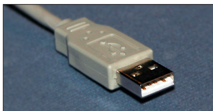
A USB series “A” plug

The last category is a point of danger for data security because people constantly plug personal storage devices into their work PCs to upload music, wallpaper images, or transmit digital photos over the Internet. Their intent may be innocent. But the capability to also siphon off corporate data from an endpoint through a USB port onto a portable storage device places organizations at considerable risk of undetected data leaks and exposure to malicious files.