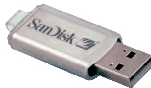
USB flash drive

The flash drive is not the only USB device capable of being used to swiftly and secretly steal data. Users may employ any of the USB storage devices mentioned above for the same purpose.