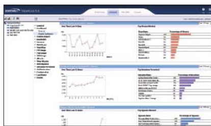
Attack Summary Collect information on thwarted attacks using SonicWALL subscription services.