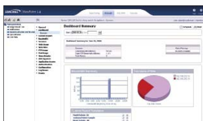
"At-a-Glance" Customized views illustrate multiple summary reports.