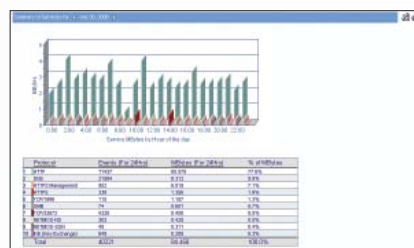
Services and Protocols Users can view the types and kinds of traffic that are transmitted throughout their network. Find out what kinds of traffic could be eliminated for maximum network performance.