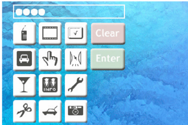
Figure 3: SMART conceptual keypad

Please input the buttons representing these concepts: Hand, Glass, Wrench, Scissors